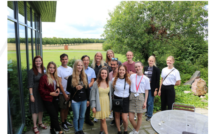
SDC students from classes of 2019, 2020 and 2021 meet in Middelfart, August 2021.