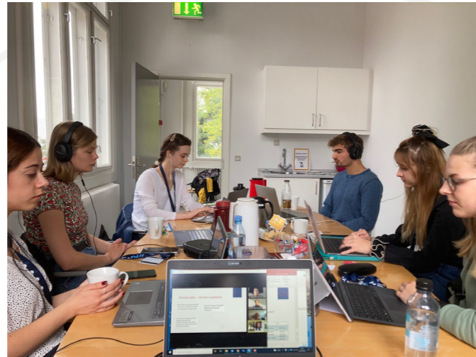
SDC students (class of 2021) at work at CFIN South in Universitetsbyen, August 2021