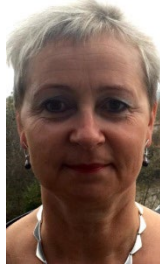
Dora Grauballe Research Radiographer